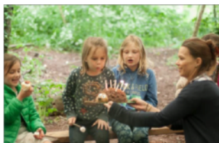
Children's Birthday Parties

Be aware of weather forecast, if your child's sleeping bag is quite thin please pack tracksuit trousers sweaters, woolly socks so they can wear them in their sleeping bag. Toastie children are happy children! We will make sure they are happy, we want them to go on and love camping and the outdoors!