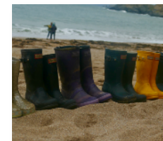
Forest School Beach School