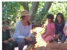
School Holiday Forest Days