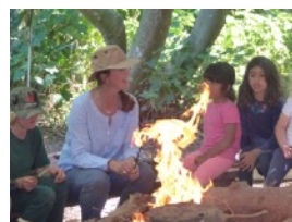
School Holiday Forest Days