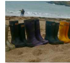
Forest School Beach School & Alternative Provision