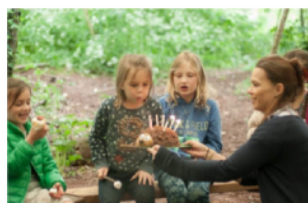
Children’s Birthday Parties

Be aware of weather forecast, if your child’s sleeping bag/duvet is quite thin please pack tracksuit trousers sweaters, woolly socks so they can wear them in their sleeping bag. They may not use them but the option is there! Toastie children are happy children! We and your teachers will make sure they are happy, we want them to go on and love camping and the outdoors!