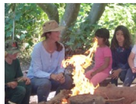
School Holiday Forest Days